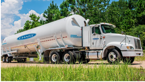
Chart Industries posts 13% order growth ahead of Baker Hughes ...